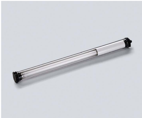
RL70E - 117